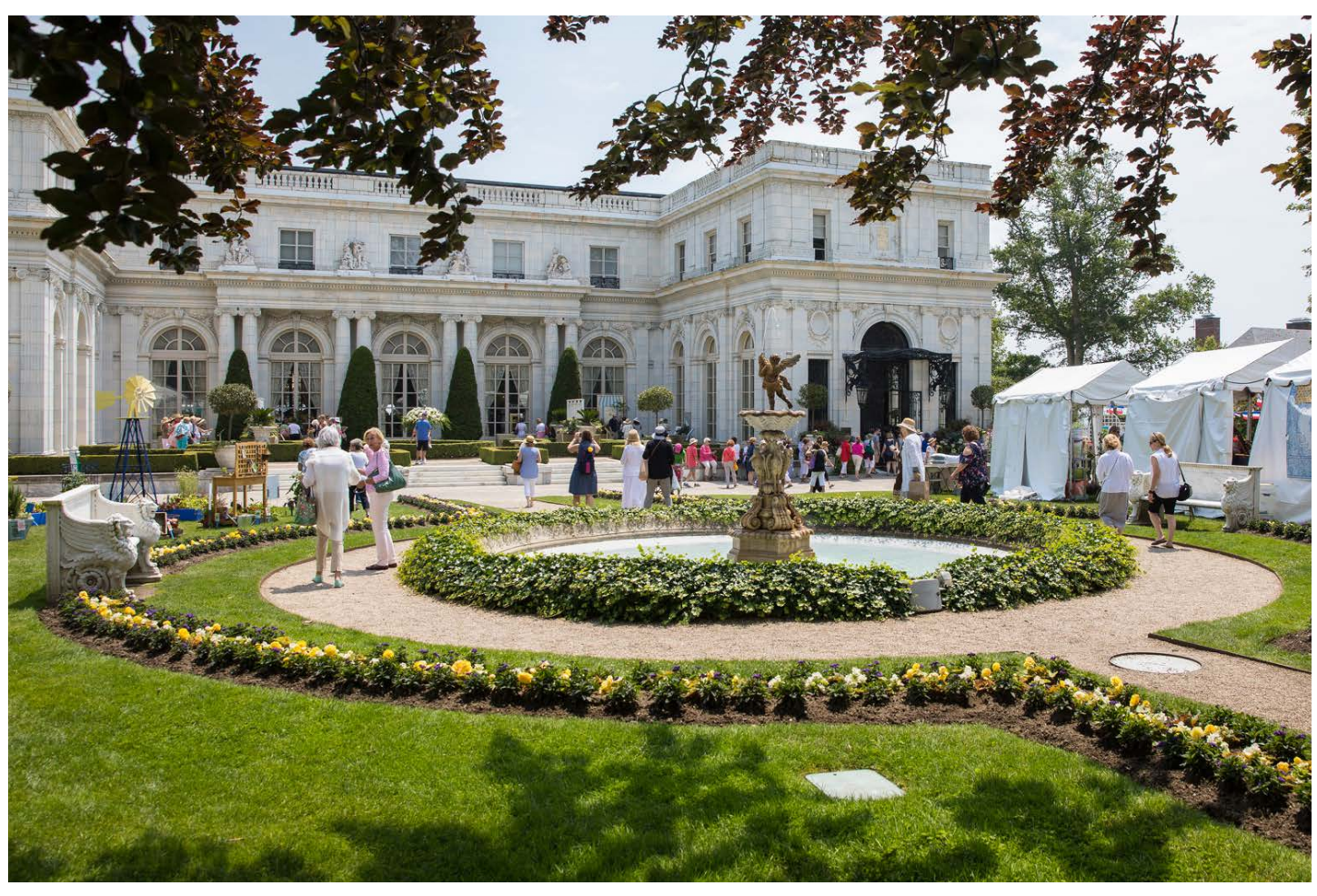
The Newport Flower Show at Rosecliff

Non-payroll operating costs totaled $8.47 million versus $8.12 million in 2016, an increase of $350,000. As was mentioned earlier, the Society significantly increased its spending on major projects by spending $2.35 million. A total of $1.79 million was spent on budgeted projects and, as is always the case when preserving our properties, there were unplanned expenditures that totaled $560,000. About $1,000,000 was spent on the new Breakers tour and store. Other noteworthy projects were the restoration of the Chinese Tea House, the completion of The Elms Scholar Center and repairs to the exterior of Kingscote.