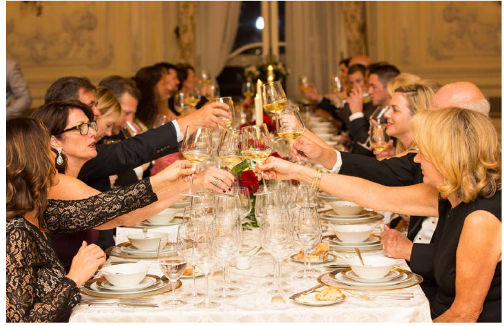
Grand Cru Dinner at The Elms