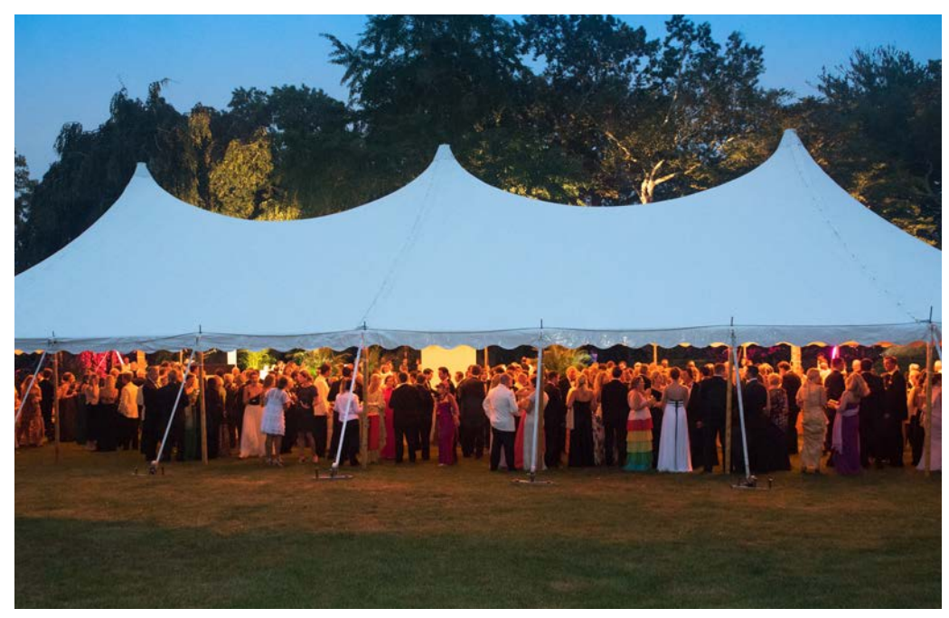
Portraits & Patrons dinner dance at Chateau-sur-Mer