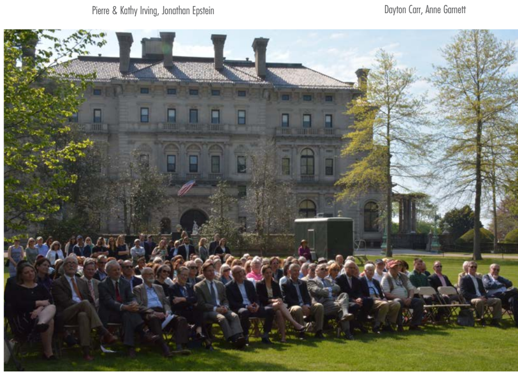
Supporters gather at the Welcome Center groundbreaking