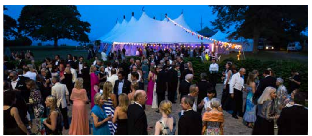
The Grand Voyage at Marble House