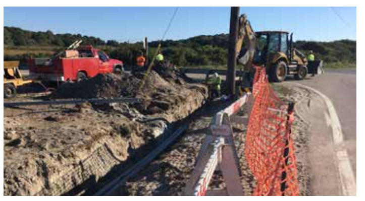
Above: Burying power lines along Sachuest Point Road will help to restore the historic viewscape. Right: Common room in the new Berwind-Stautberg Center in The Elms Carriage House