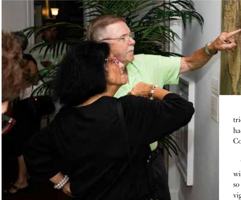
Visitors examine a map displayed as part of the exhibition Newport and Her Southern Sisters at Rosecliff

Headquarters for the PS then was at 118 Mill Street, which was the Warren family home. Back to being a private residence, it is owned by an individual who is clearly sensitive to the history of the house and, very importantly, its Christopher Tunnard gardens.