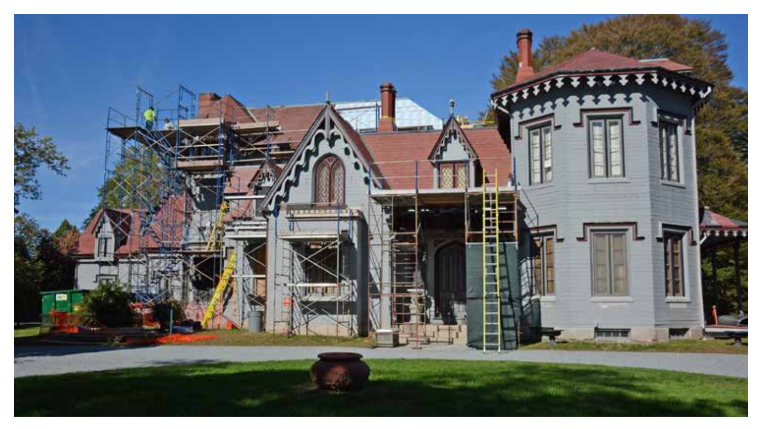
The exterior restoration of Kingscote continued in 2016