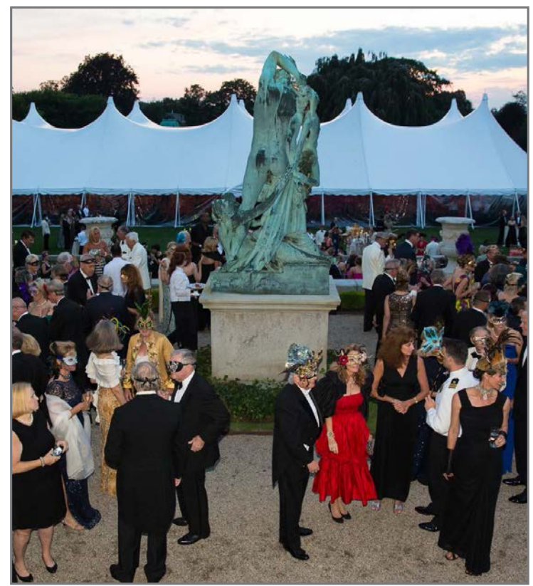
The Venetian Ball at The Elms was one of many successful fundraising events.

The Preservation Society is now the proud owner of two marble busts which have been on display (as loans) in The Breakers since 1927 –