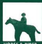
HORSE & RIDER