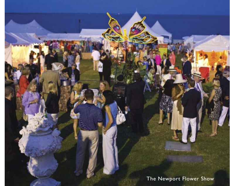
The Newport Flower Show

PRINTED tours are also available in Italian, Mandarin & Korean at The Breakers.